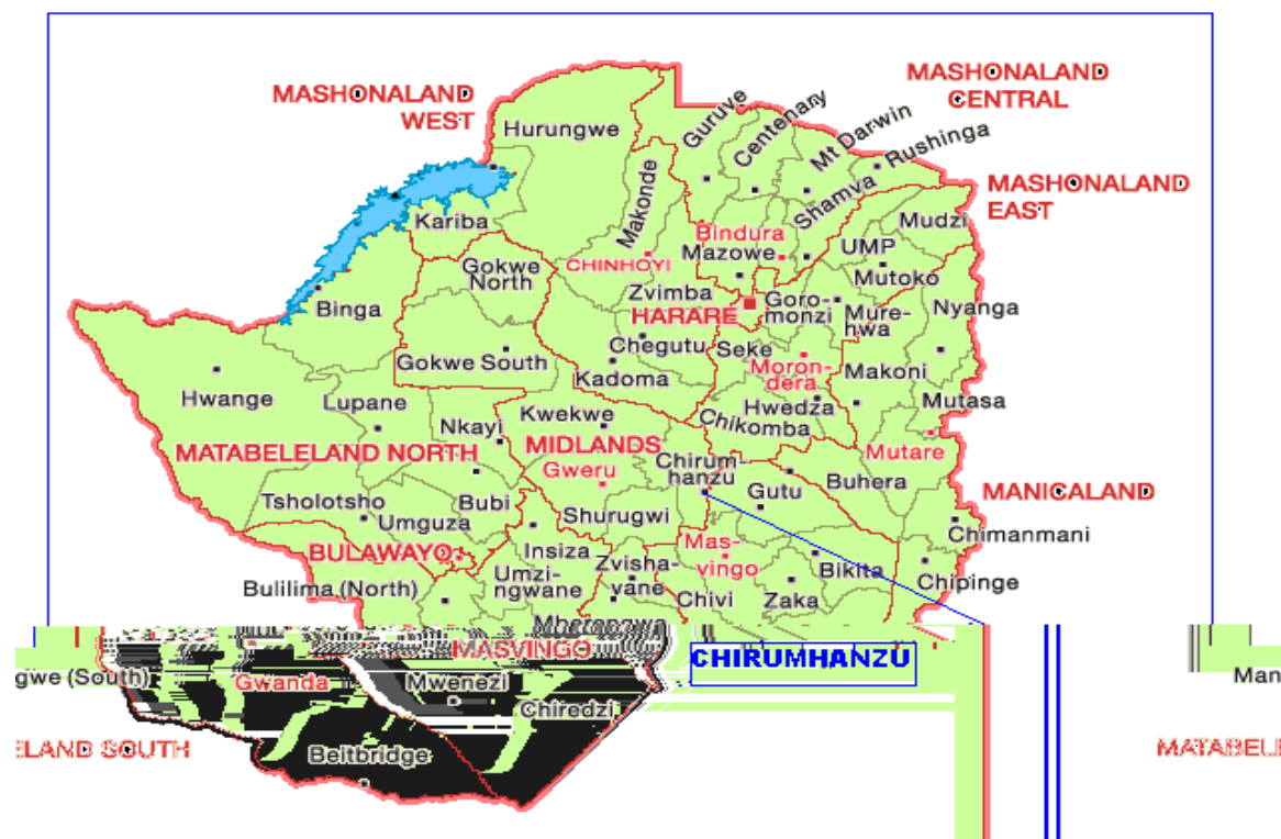
Figure 2: Map of Zimbabwe showing Chirumhanzu (Study Area)

Hama Mavhaire irrigation scheme is in Chirumhanzu District in the Midlands Province of Zimbabwe. It is 200km from Harare. This is an area of erratic rainfall between 400mm and 510mm per annum with temperatures ranging from 24°C to 31°C and is in natural farming Region IV. Soils are mainly from the granite parent material. Due to the climatic conditions in the area, crop production may not be productive and most farmers concentrate on livestock production, mainly the small ruminants. The introduction of irrigation schemes in the area has seen some crops mainly maize, groundnuts and some high value crops such as paprika and sugar beans being produced by the farmers. The main irrigation systems in the area are sprinkler and flood.