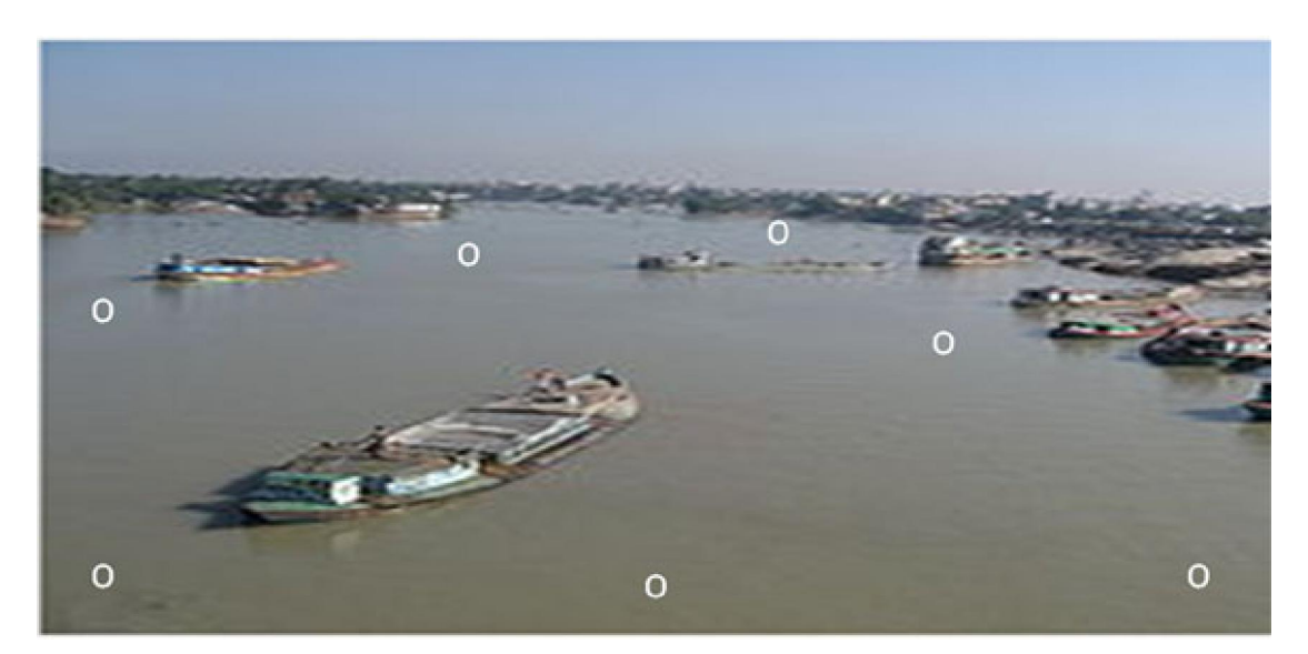
Plate 1: Bangsai river of Bangladesh (near Savar). O Fish samples collection spot

To assess the precision of these methods, standard solution of anthracene was determined six times on the same day and over a six-day period. The results showed good precision. The accuracy of the method was evaluated through recovery studies. The recovery experiments were performed at three concentrations (1, 2 and 5 ng) of the standard added to sample solutions, in which the marker content had been determined, using a sample from the most polluted part of Bangsairiver. The results for the recoveries of anthracene were in the range of 71–85.32 %. The limit of detection (LOD) of the GC-MS method, established at signals three times that of the noise for anthracene was 2.5 ng.