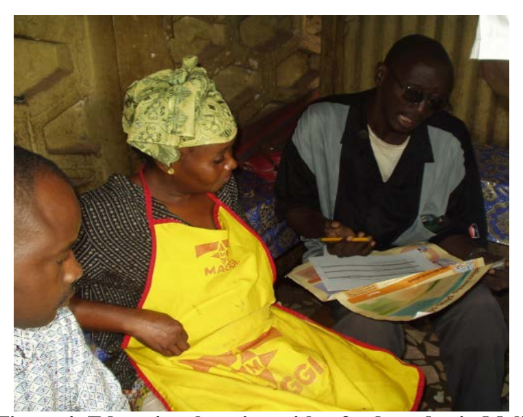
Figure 4: Educational session with a food vendor in Mali

In Mali, a food safety campaign commenced with the adaptation of the WHO five keys to safer food messages into the socio-cultural context of the country. This was done in the effort to ensure that the messages reached food handlers and the public and are translated into positive actions. The campaign included a baseline study of food safety conditions in food establishments in six districts of Bamako and training on the WHO five keys to safer food messages including educational sessions with the food handlers in the different food establishments [15].