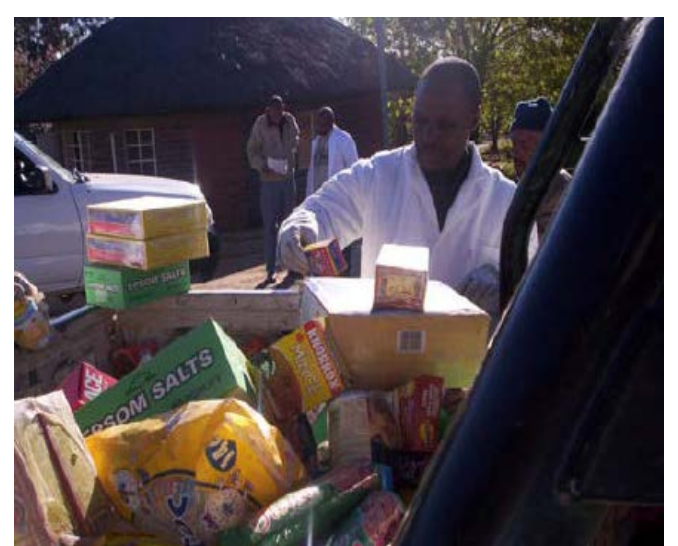
Figure 3: Inspection of food establishments in Lesotho as part of the food safety campaigns

Professional food handlers in food and catering establishments, including street food vendors, have been an important target group for training and education in food safety. In Lesotho, a food safety campaign was conducted in Mohale's Hoek district with the theme "Food Safety in All Food Establishment: A Key to Good Health" [15]. The district was among, five districts that were involved in a baseline study on food safety in 2005. The findings of the study formed the basis for planning of the food safety campaign [15]. The overall objective of the campaign was to communicate the importance of food safety to owners of food establishments, food handlers as well as street food vendors.