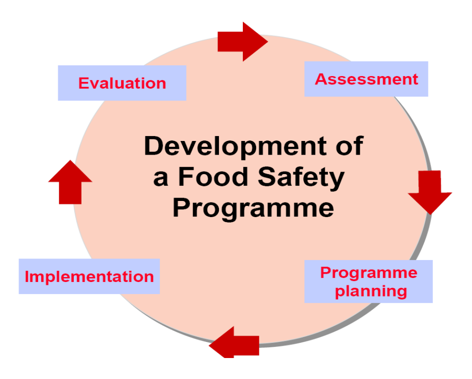
Figure 2: Process for development of a National Food Safety Programme