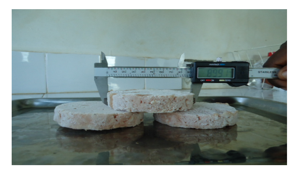
Plate 1: Measurement of Diameter of burgers

The thicknesses and diameters of the products were measured using digital callipers before and after cooking, as shown in Plates 1 and 2 below: