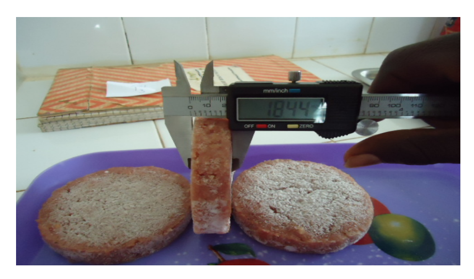
Plate 2: Measurement of Thickness of burgers

The cooked thicknesses and diameters of the individual products were subtracted from the fresh ones to obtain the changes in thickness and diameters (in millimetre).