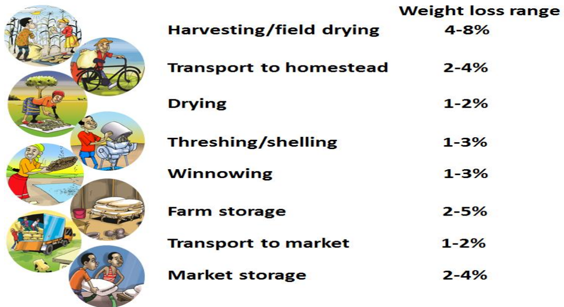
Figure 3: Typical ranges of weight losses for various links in the post-harvest chain Source: [14].