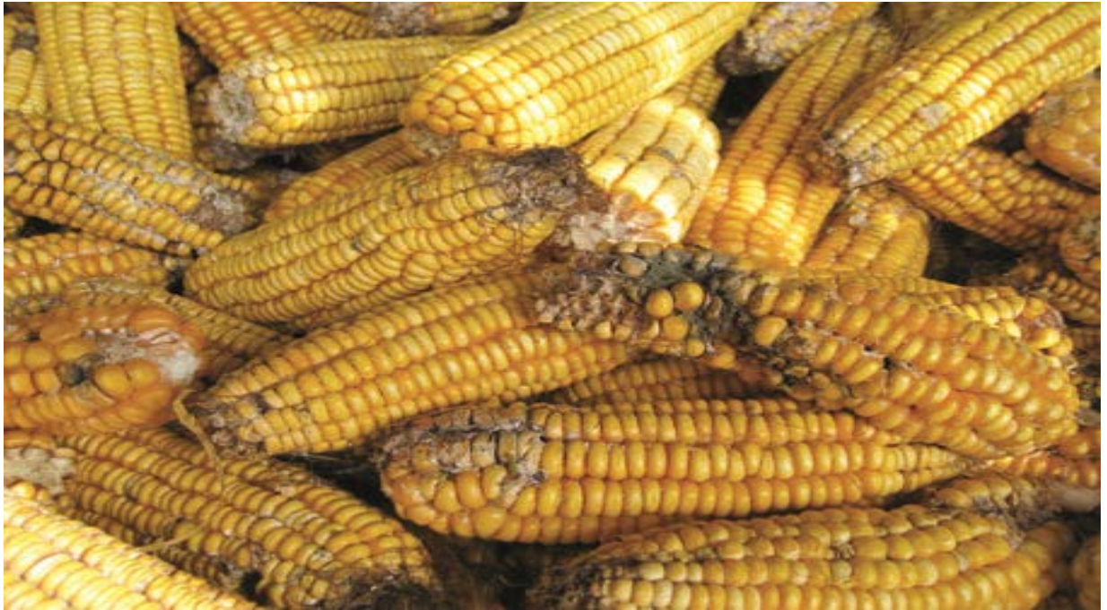
Figure 1: Example of maize grain loss to moulds

Post-harvest food losses occur during harvesting and handling due to grain shattering, spillage during transport and biodeterioration at all steps in the post-harvest chain. The principle agents of biodeterioration can be moulds, insects, rodents and birds.