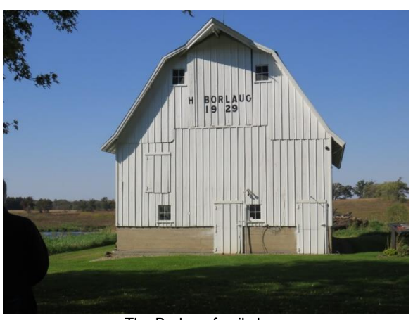
The Borlaug family barn where they kept their animals and milked their cows