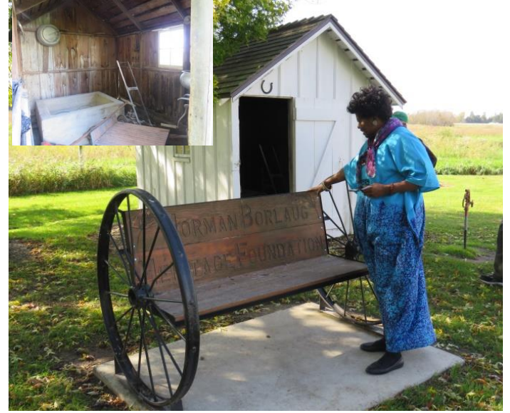
The milk shed/ outdoor refrigeration. To keep milk cool, they would put the pales of milk in a tub full of water (inset) that would be constantly refilled by water pumped from a deep cool well