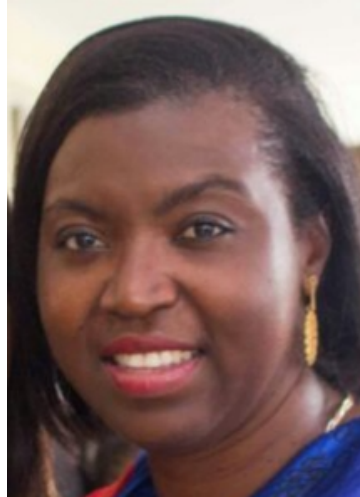
Kikelomo O. Wright

Wright KO 1* , Shogbamimu Y 2 , Akinbami AA 3 , Adebisi R 1 , Senbanjo IO 5 , and AO Ogbera 4