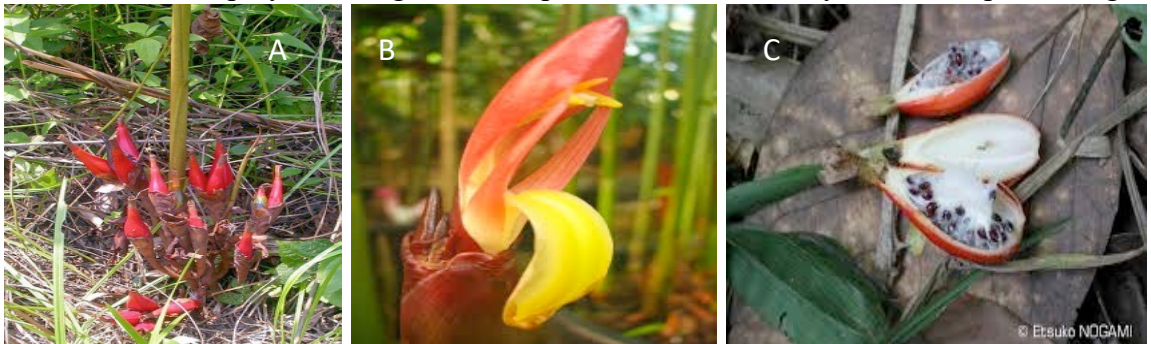
Figure 2: A. anguistifolium fruits attached to the parent plant (A), flower (B), freshly cut fruit (C)

A total of thirty fruit samples from highly inhabited swampy areas were randomly collected from Wakyato and Kapeeka sub-counties in Nakaseke district. The fruits were cut from the plant (as shown in Figure 2 A) using a knife and then immediately packed in labelled sterile polythene bags and transported to the laboratory for further processing.