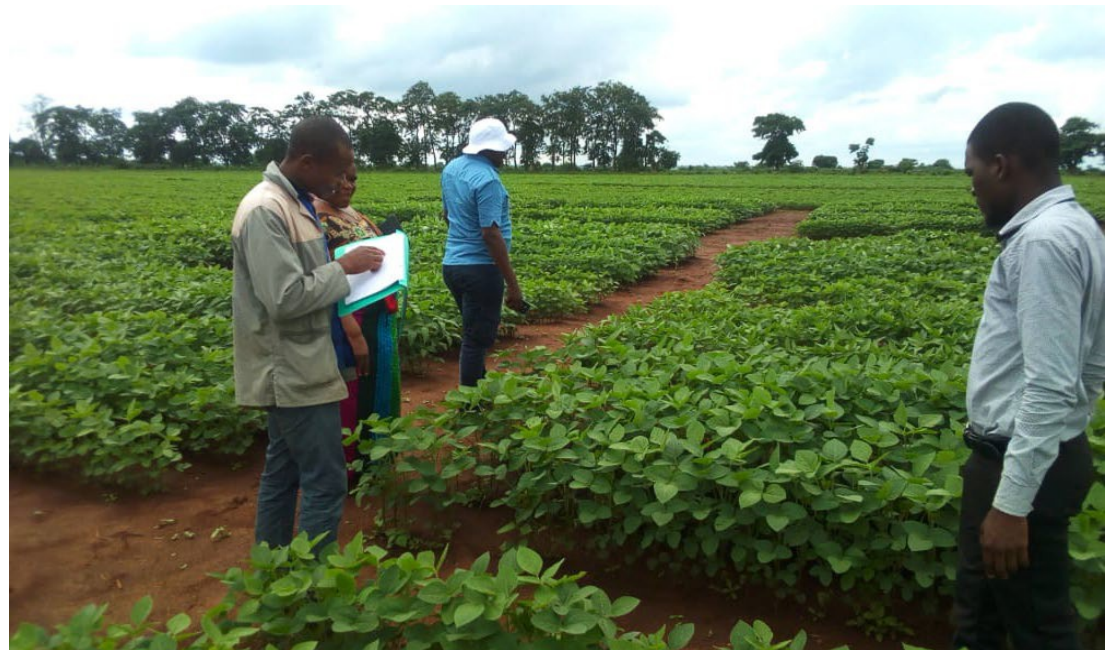
Figure 2: Soybean trials at Chitedze, Malawi - 2018/19 season.

Figure 1: African countries where the Pan-African Soybean Variety Trials are implemented