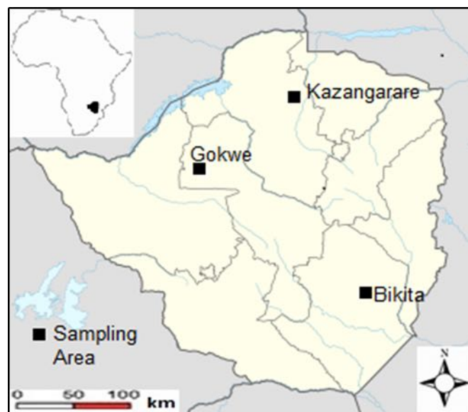
Figure 1: Sampling sites (Bikita, Gokwe, Kazangarare) in Zimbabwe

The fruits were obtained in Gokwe (semi-dry region located 18.22°S 28.93°E in Agro farming region 3), Kazangarare (semi-hot area located 16.30°S 29.56°E in Agro farming region 2b and part of 3) and Bikita (dry area located 20.5°S 31.37°E in Agro farming region 4) in Zimbabwe (Figure 1). U. kirkiana fruit trees are widely distributed in the forests and have adapted well to the conditions of the areas.