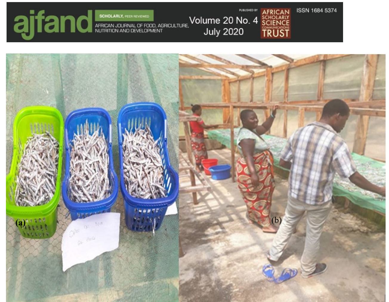
Note: plate 1a shows the processed solar drying fish and plate 1b shows the fish solar drying process