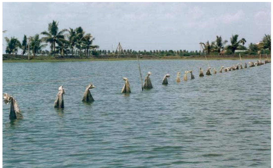
Plate 1: Suspended feeding bags in a fish pond [29]

and results in higher growth rates, improved feed ingestion rates, and higher retention rates [10].