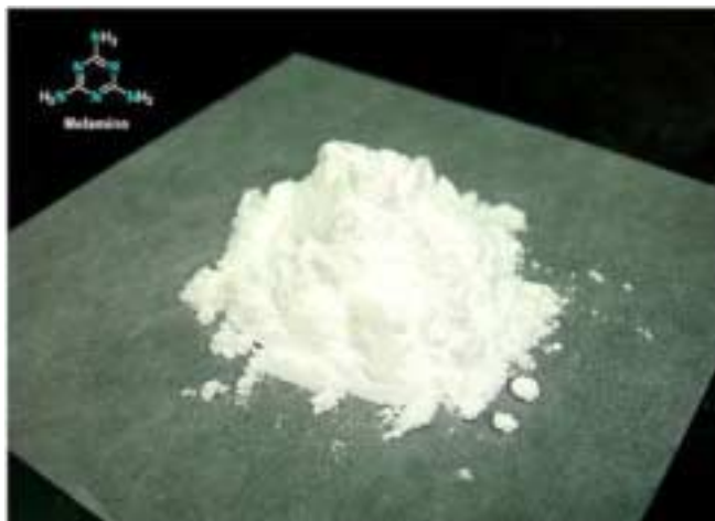
Figure 1: Typical melamine powder

reported detection of melamine in other product categories, such as confections and beverages. Generally, there are available analytical methods that can reliably detect a level of 1 ppm melamine in some food matrices.