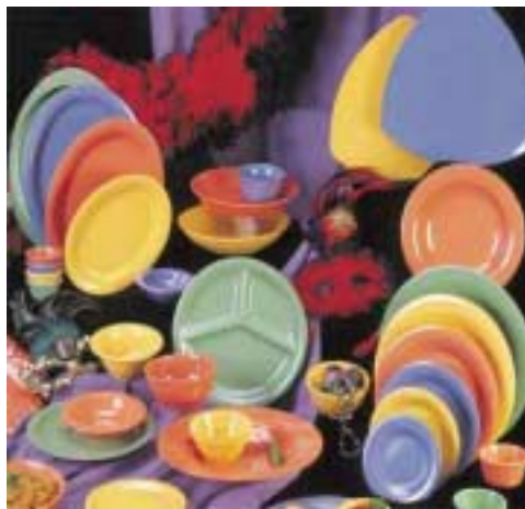
(a) plastic wares

Melamine, in its chainlike "polymerized" form, is an industrial chemical and has been used for decades in manufacturing of dishes, plastic resins, flame-retardant fibers, components of paper and paperboard and industrial coatings (Fig. 3). It has only very limited exposure in foods from these food contact substance uses. The estimated level of melamine in food resulting from all of these uses is less than 15 µg/kg (0.015 ppm) [4]. Additionally, trichloromelamine is approved for use as a sanitizing agent on food processing equipment and utensils, except for milk containers and equipment. Trichloromelamine readily decomposes to melamine during its use as a sanitizer.