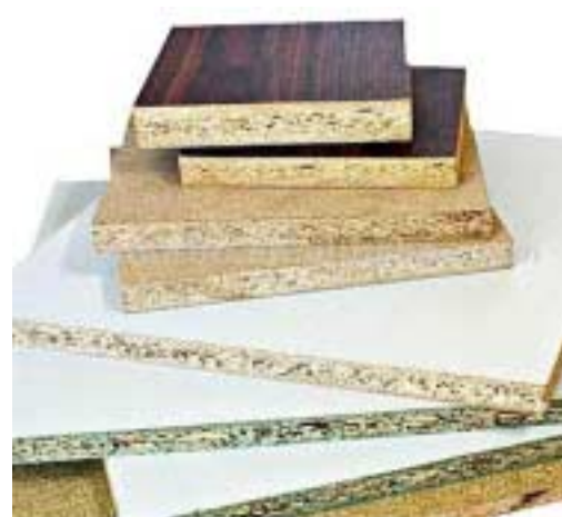
(b) wooden boards