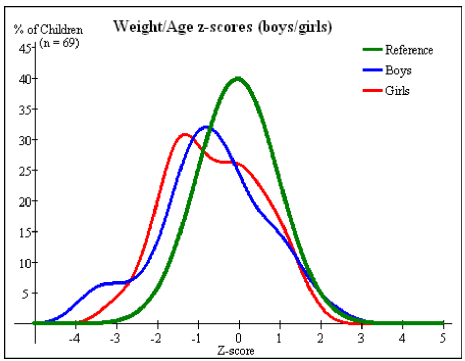
Figure 1: Frequency curve of weight for age z-scores for boys and girls in relation to reference z-scores

About 23% of the children below five years of age were stunted of which 9% were severely stunted, 11% were underweight of which 4% were severely underweight and 3.5% were wasted. Malnutrition among children of HIV-positive mothers/caregivers in the study area is therefore of public health concern because in a population of healthy and well-nourished children, only 2% of them are expected to fall below <-2 SD for each of the three indices [11,19]. The proportion of stunted children among households in the study area was consequently almost 12 times the level expected in a healthy, well-nourished population, more than five times for underweight and about twice the wasting level. The level of malnutrition among children of HIV-positive mothers/caregivers was not significantly different from the urban prevalence rate of acute malnutrition in Uganda reported in the 2006 demographic and health study [11].