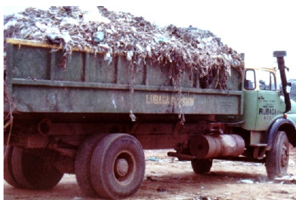
Mode of transporting waste