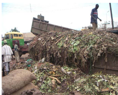
Heaps of various agricultural wastes

surface waters. For that reason, nitrate leaching is considered a major nitrogen (N) pollution concern on livestock farms [11]. When phosphorus (P) enters the surface waters from land application of excessive animal manure it can stimulate the growth of algae and other aquatic plants. Their subsequent decomposition results in an increased oxygen demand that interferes with the welfare of fish. Manure decomposition can be a major source of methane (CH 4 ), ammonia (NH 3 ) and nitrogen oxides, which contribute to accumulation of greenhouse gases. Volatilization of ammonia causes acid deposition, which contributes to acid precipitation [12, 13]. Emissions of nitrous oxide (N 2 O) during the nitrification-denitrification cycle contribute to ozone depletion [14].