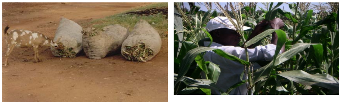
Figure 3: The wastes are eaten by goats for production of meat while compost applied on soil increases maize production.

Turning these agricultural wastes (crop residues and animal manures) into organic fertilizers (through composting) is one of the waste treatment technologies that make it possible to use organic waste as a fertilizer even in populated areas. Technology plays a key role in soil fertility improvement, and hence crop productivity [15, 16]. The use of organic fertilizers is particularly important in most parts of Africa, where low availability of nutrients is a serious constraint for food production [17]. Composting also reduces the volume of the waste, hence solving serious environmental problems concerning disposal of large quantities of waste, kills pathogens that may be present, decreases the germination of weeds in agricultural fields, and reduces odour [18]. The compost can be sold for additional revenue or used on the same farm. Besides, the production of composts for agricultural use is gaining popularity as a result of the rising interest in organic products such as goat meats and maize)(Fig. 3).