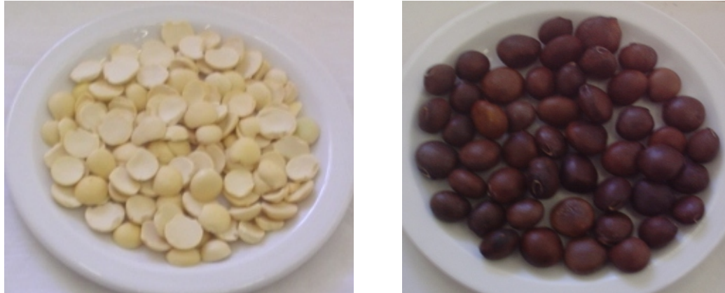
Figure 1: Shelled and unshelled morama bean seeds

National Food Technology Research Centre (NFTRC), Kanye, Botswana and kept at 28-30°C until further analyses.