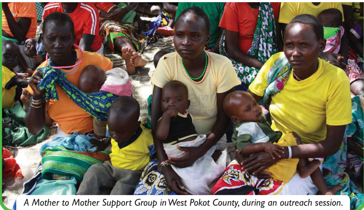
A Mother to Mother Support Group in West Pokot County, during an outreach session.