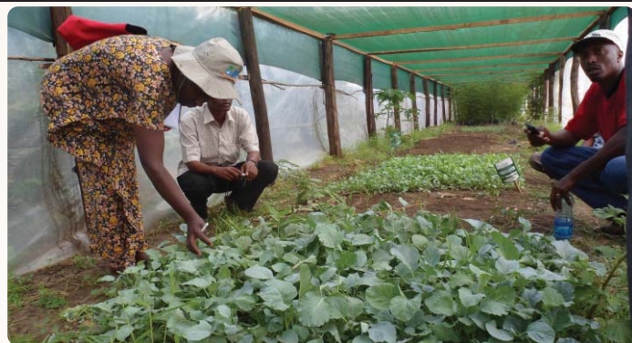
A demonstration farm nursery in Kina, Isiolo County.