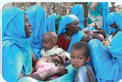
Barambate Mother to Mother Support Group.