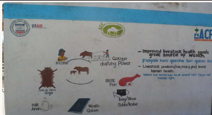
Nutrition and livelihoods messages on a wall in Duse livestock market, Garbatulla.