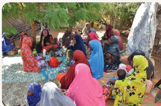
Mother to Mother Support Group meeting in Kambioos refugee camp in Dadaab Sub-county.

The programme is funded by the United Nations Children's Fund (UNICEF).