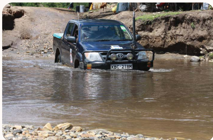
ACF vehicle crosses a flooded river, on the way to a Mother to Mother Support Group's session in Cheptul village, Pokot Central Sub-county.