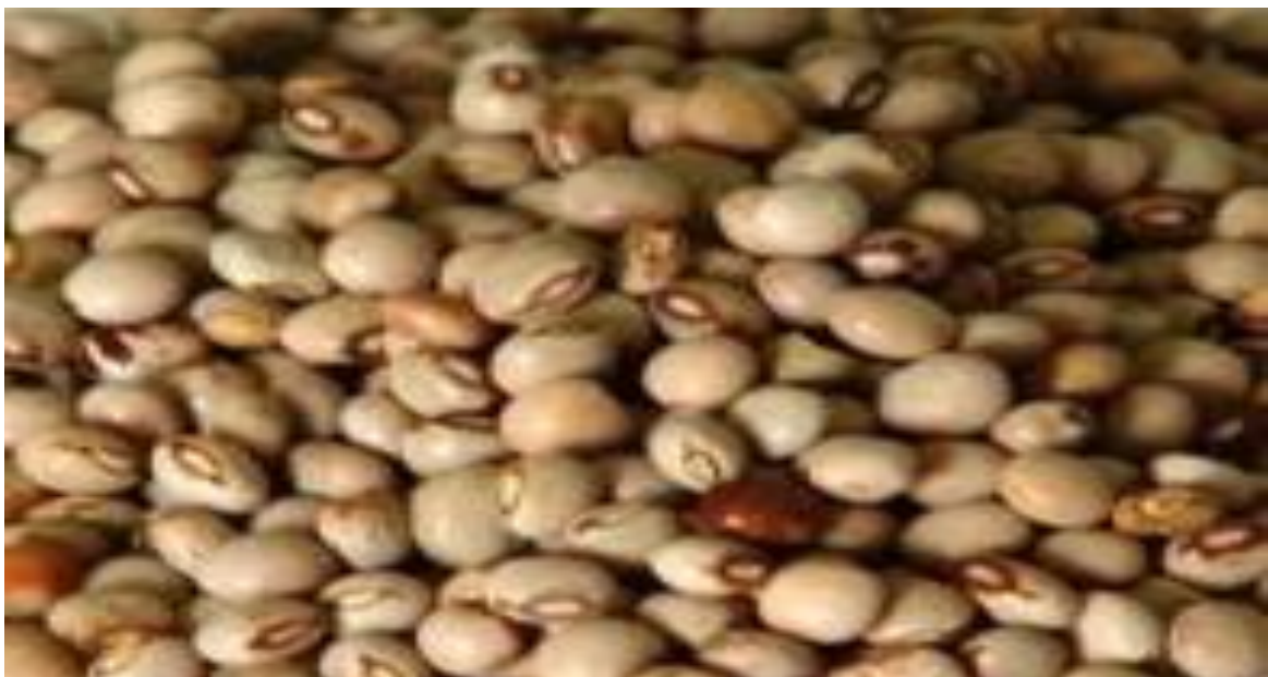
Figure 1: Pigeon Pea Seeds

Pigeon pea ( Cajanus cajan ) is an important food legume that its cultivation has been reported in more than seven countries including Nigeria [7, 8], and is a useful fallow and fodder plant with edible seeds doing best on medium good soils [9]. It is still under-utilized as food in Nigeria due to its tough texture, long cooking duration and lack of education on its nutritional potentials [8, 10, 11]. Women cook it using firewood overnight for about 8 - 12 hours. This consequently leads to high loss of nutrients [12]. The seed, apart from being hard to cook is hard to dehull, thus the drudgery process of dehulling the seed is also limiting its utilization into other form of products [13].