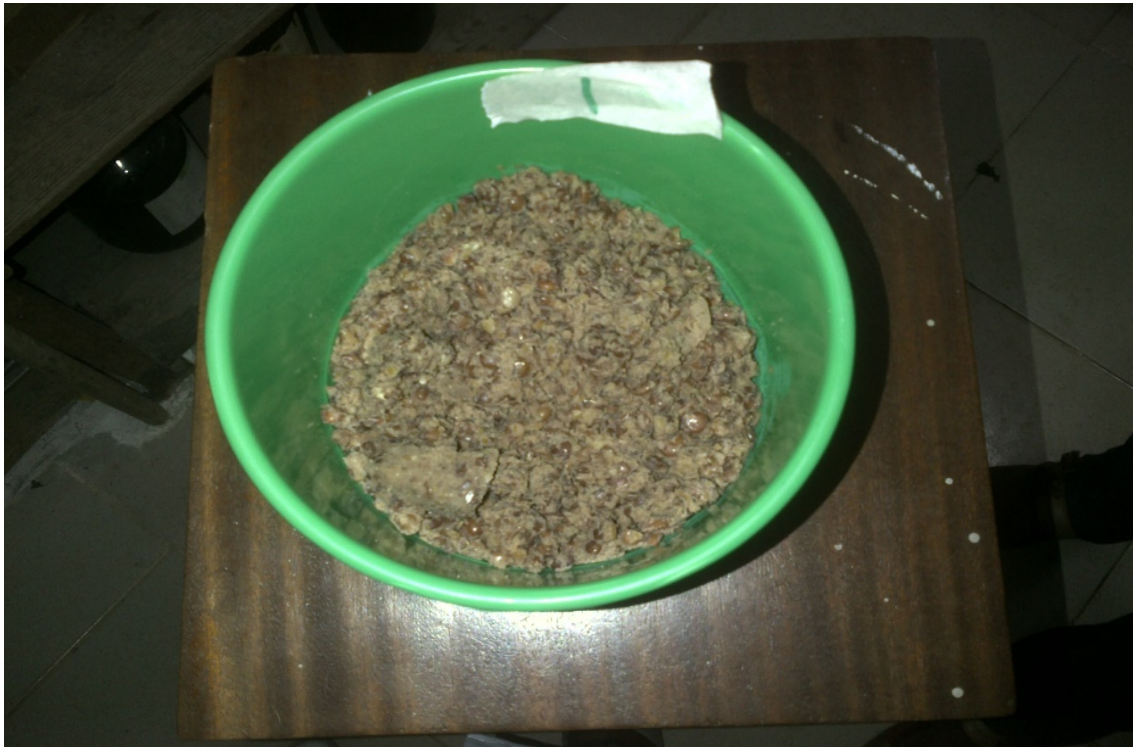
Figure 4: Cooked undecanted Pigeon pea (Sample 2)