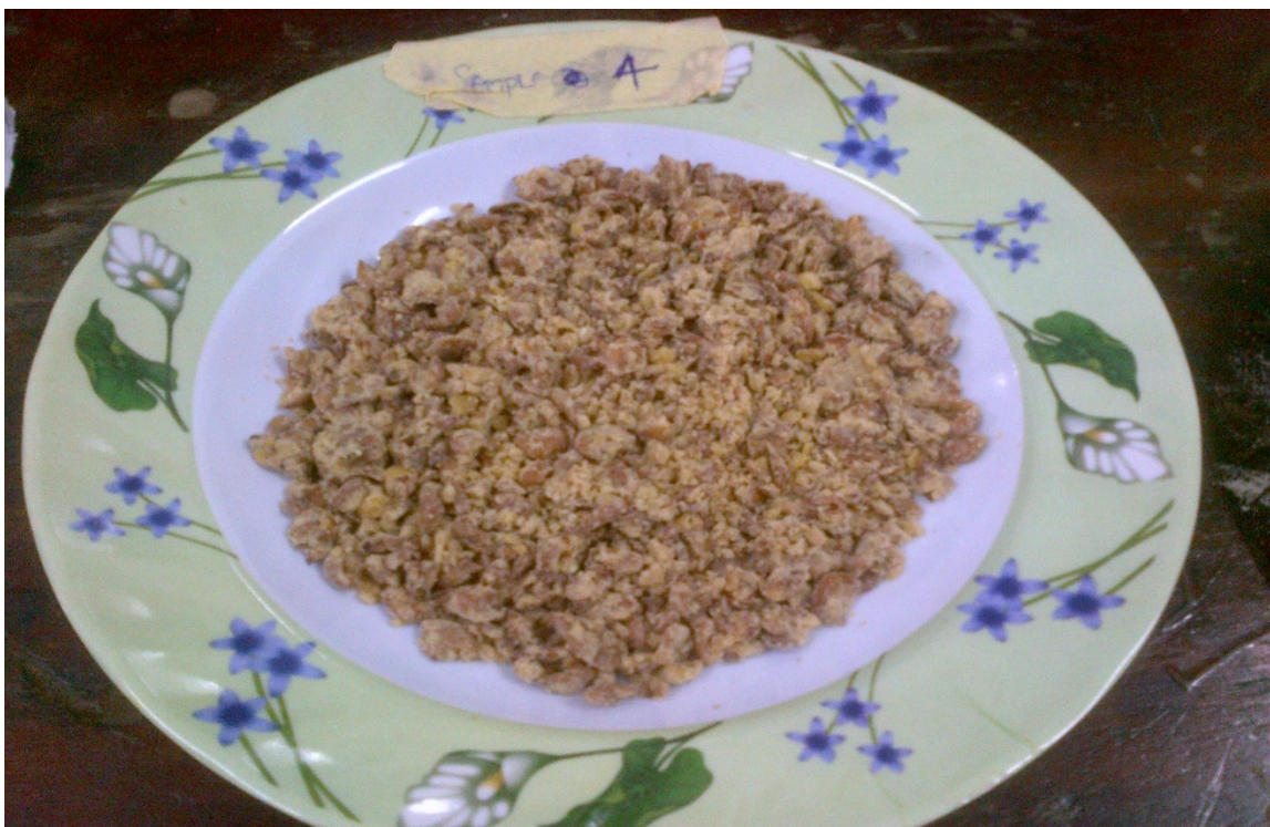
Figure 7: Pressure-cooked and decanted Pigeon pea (Sample 5)