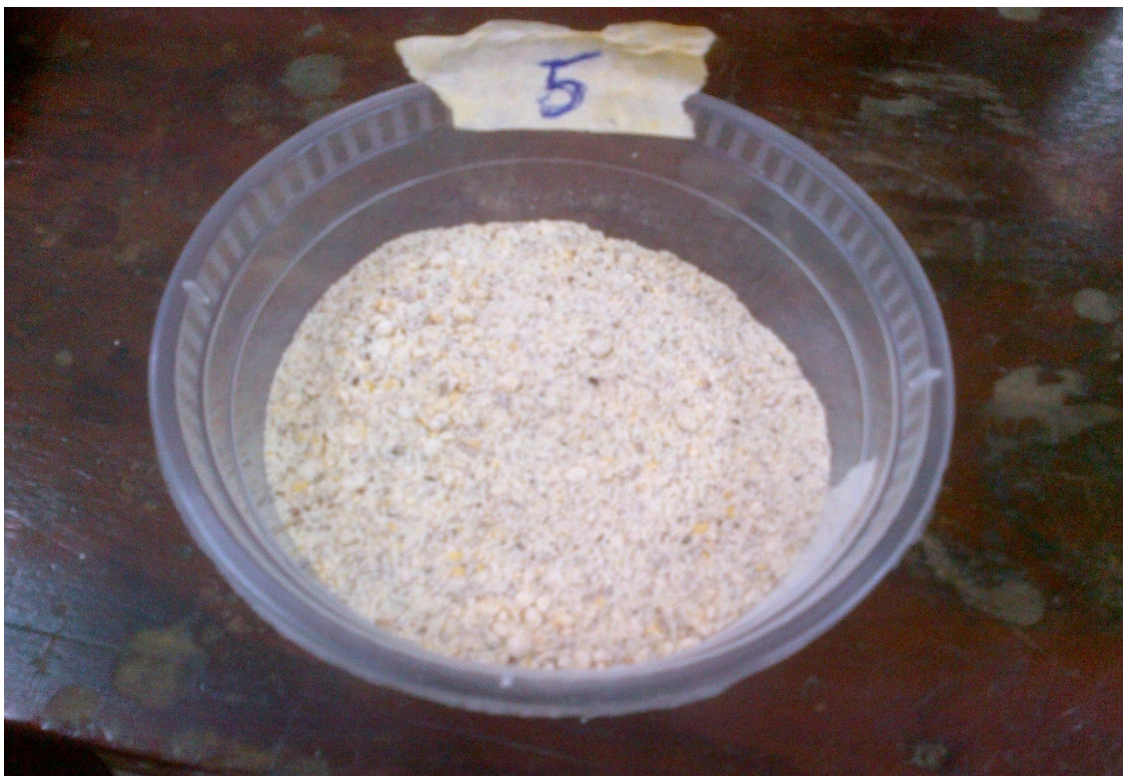
Figure 3: Raw Pigeon pea (Sample 1)