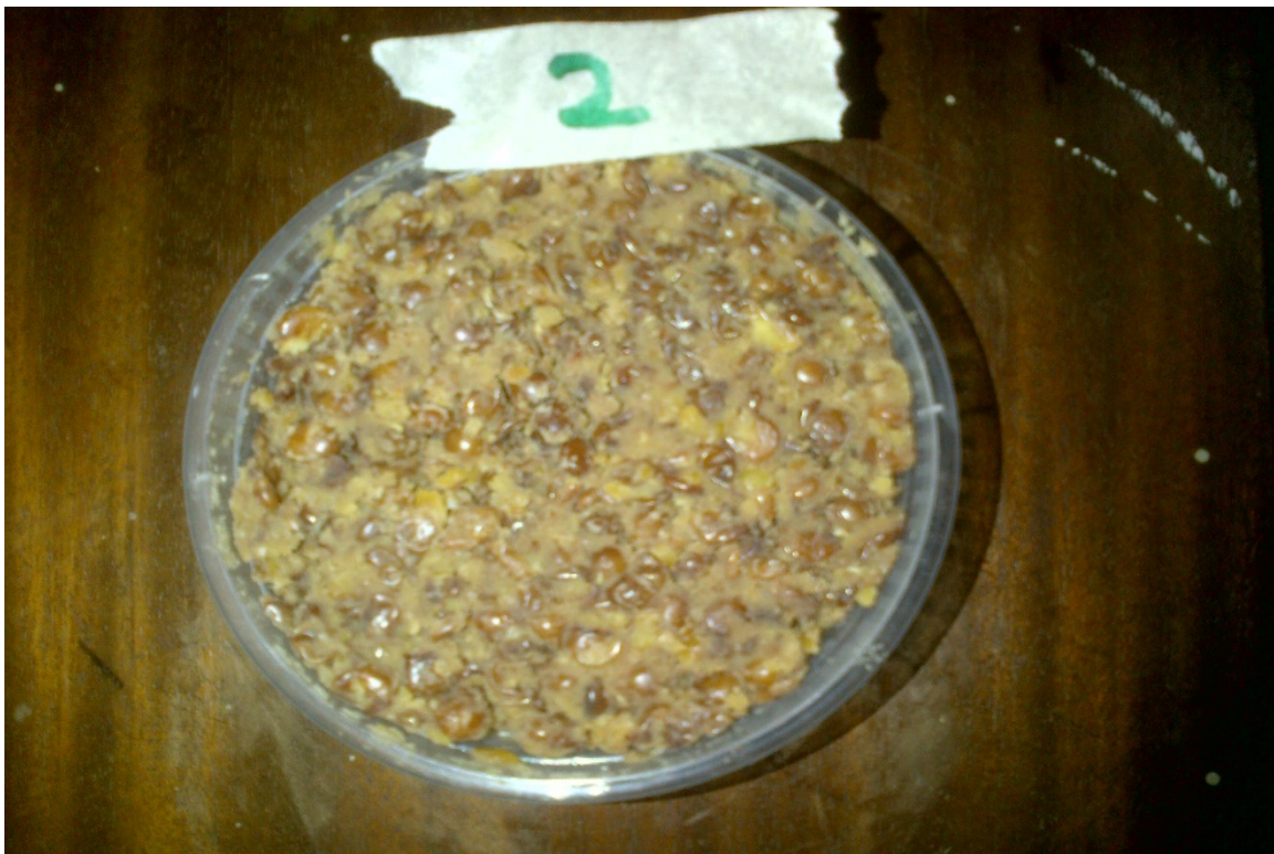
Figure 5: Cooked and decanted Pigeon pea (Sample 3)