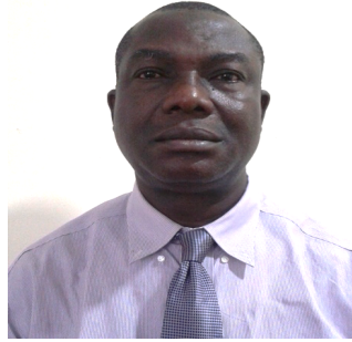
Adepoju Oladejo Thomas

Adepoju OT 1* , Dudulewa BI 1 and AY Bamigboye 2