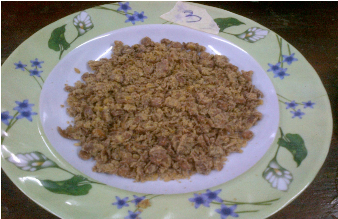
Figure 6: Pressure-cooked undecanted Pigeon pea (Sample 4)