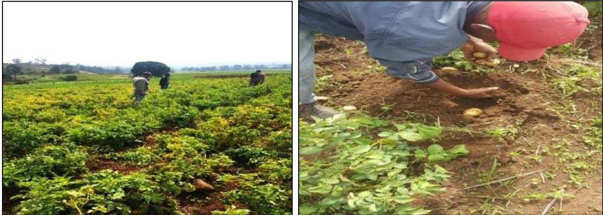
Figure 3: Farmers' potato maturity determination (a) and harvest practices (b) in the survey area (2022)

of the local consumers, farmer nearby market, distant market, or long-term storage plan.