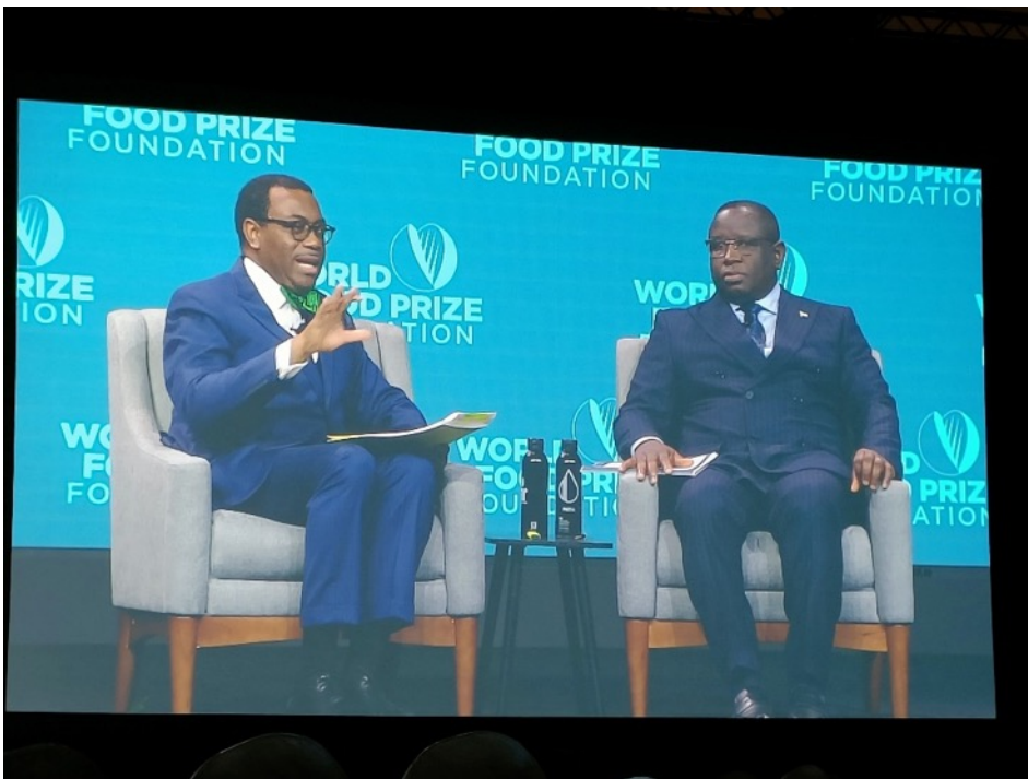
The Hon. Akinwumi Adesina, President, African Development Bank Group (left) with H.E. Julius Maada Bio, President, Republic of Sierra Leone.