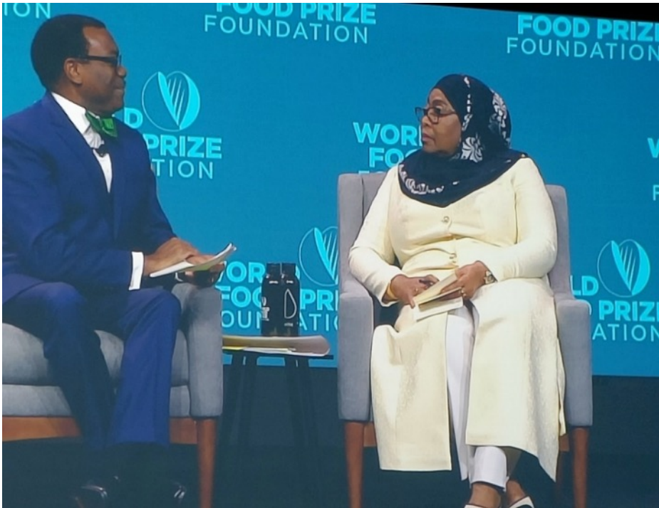
The Hon. Akinwumi Adesina, President, African Development Bank Group (left) with H.E. Samia Suluhu Hassan, President, United Republic of Tanzania.