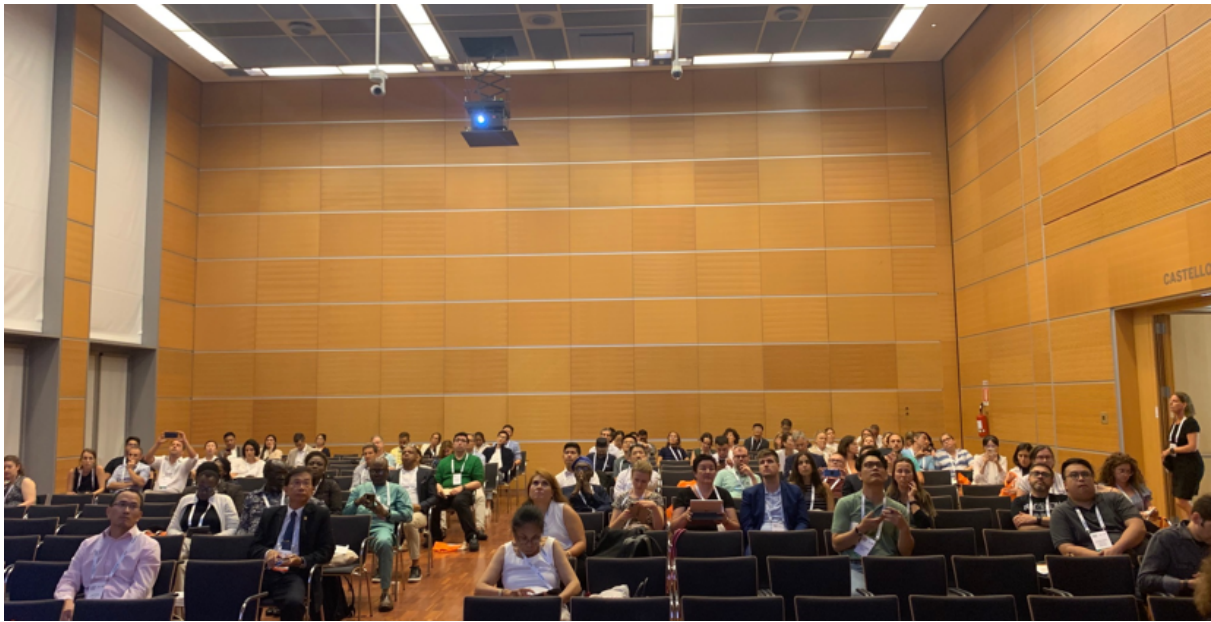
Our GHI special session audience